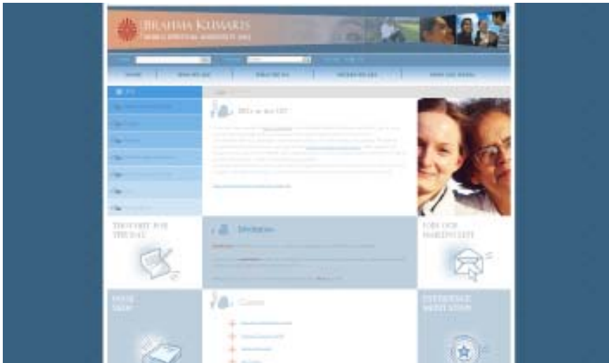
Screen shot of the UK home page.