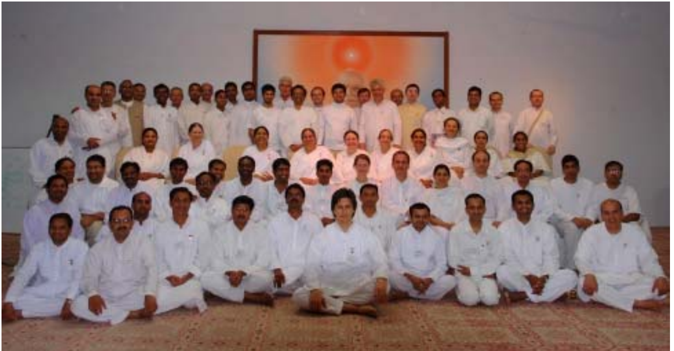
Participants in the October 2006 Global IT Retreat in Shantivan