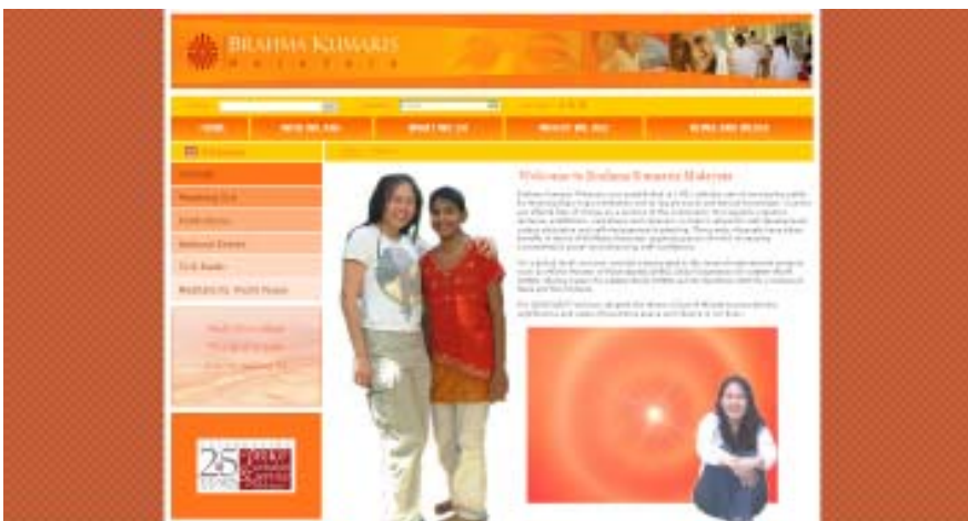
Screen shot of the Malaysian home page. Based on the structure of the UK site above, it has its own unique flavor and style. Even the banner images are unique to the country.