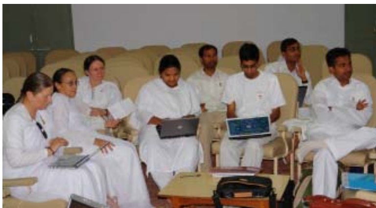
USA and Canadian participants, joined by Sr. Denise, begin to plan their country models.