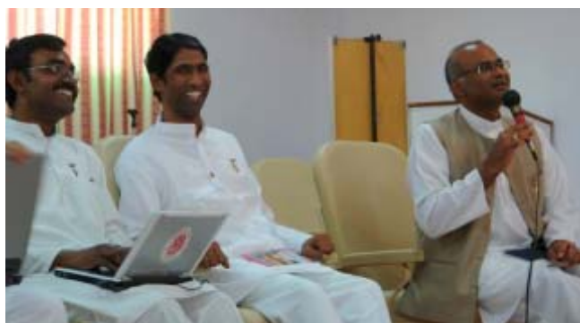
IT meetings are a lot of fun!