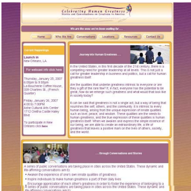
Screenshot of the Human Greatness Website