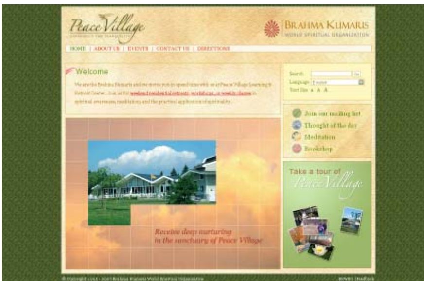
Screen shot of the Peace Village Retreat Centre home page.